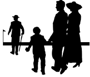
BUT – they say The law is done Away with! SO -The People