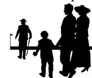
If there is no LAW- and No SIN, then there is no GOSPEL! SO -The People