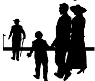
If there is no LAW- and No SIN, then we don't need a SAVIOR! SO -The People