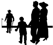
If there is no LAW- and No SIN, then we don't need GRACE! SO -The People