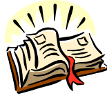
The gospel 'Good News'